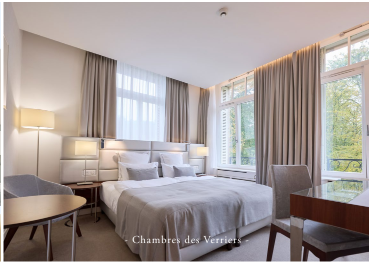
- Chambres des Verriers -