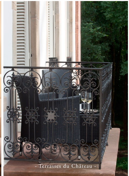
- Terrasses du Château -