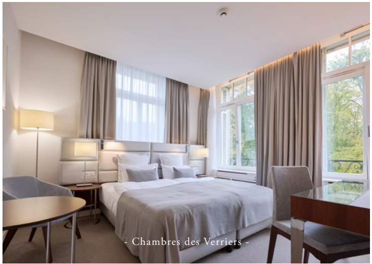
- Chambres des Verriers -