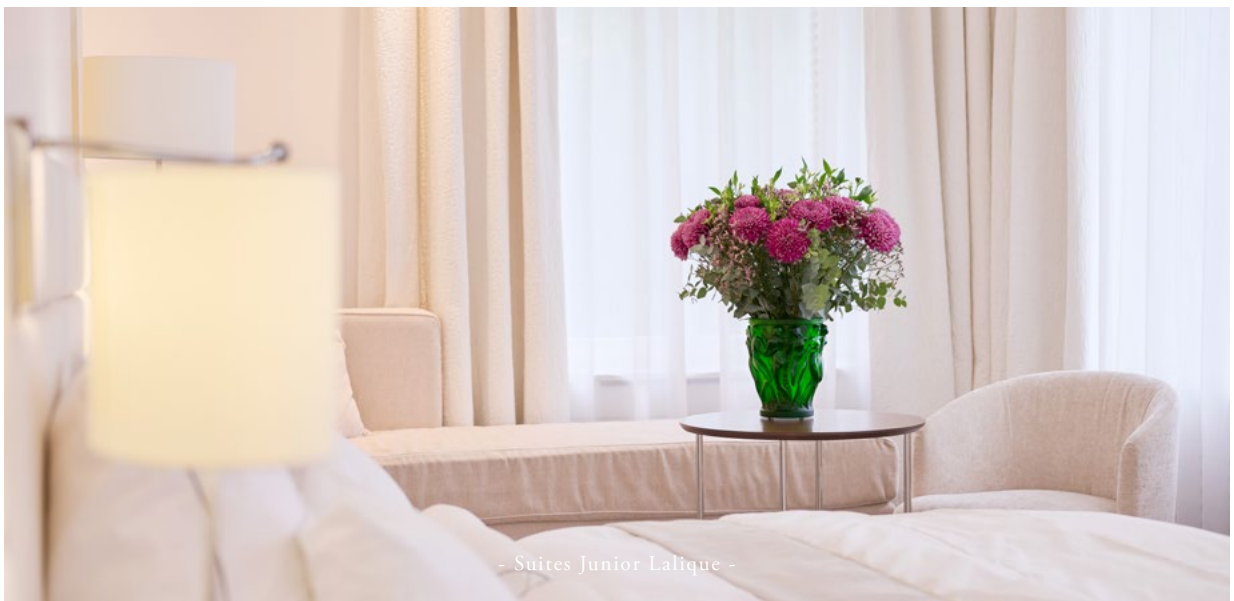
- Suites Junior Lalique -