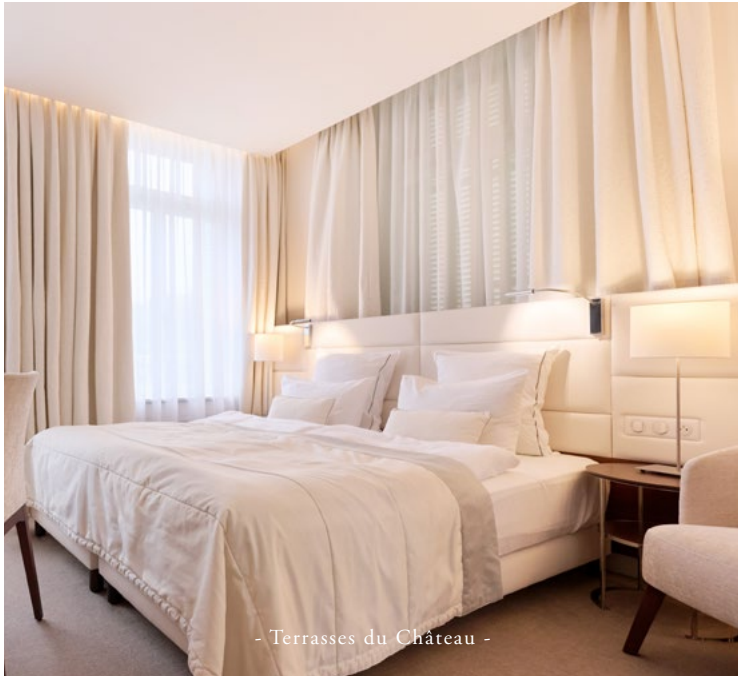
- Terrasses du Château -