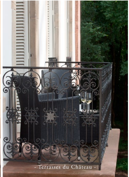
- Terrasses du Château -